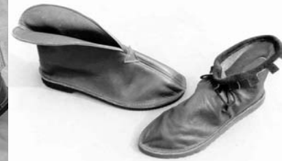
DOVE, ROBIN HOOD