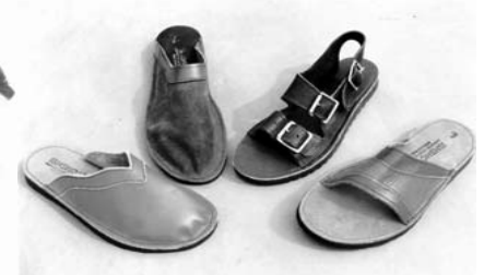
CLOGS, BUCKLE, SLIP ON