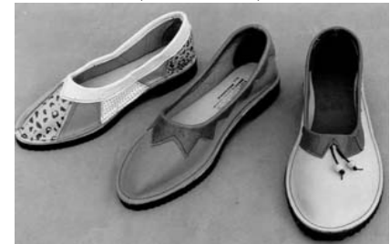
PATCHES, PETAL, BIDI