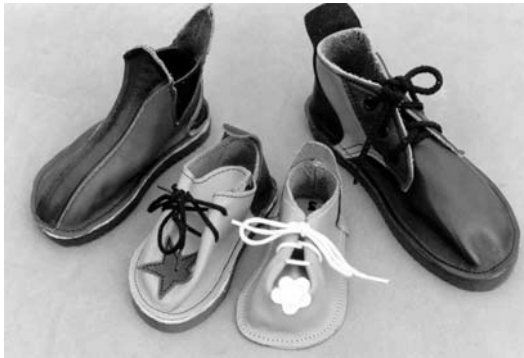
GOBLIN, LACE UPS, DESERT BOOT