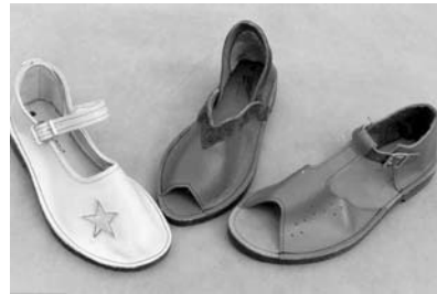
GELLI, SUNSHOE, 'T' BAR