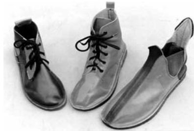
DESERT BOOT, OTWAY, GOBLIN