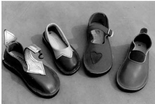
JESTER, PETAL, GELLI, ELASTIC