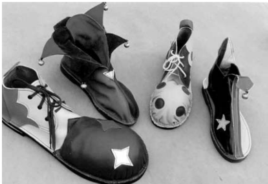
CLOWN SHOES MADE TO ORDER