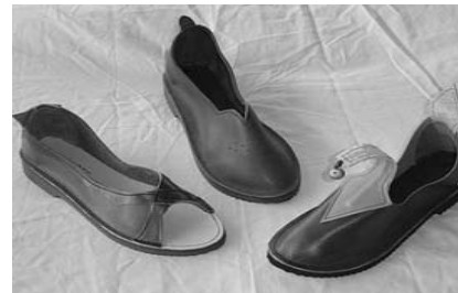
JEWEL, MING, JESTER