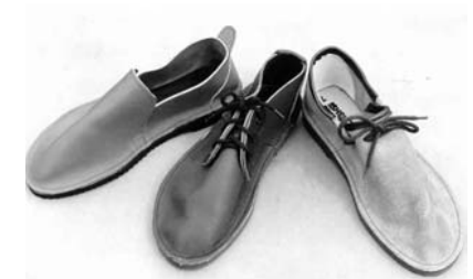
CREEPER, LACE UP, SHEARER